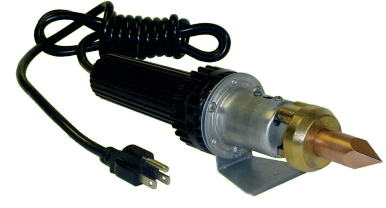
Rhinehart Model X-50 Dehorner (Shown with Solder tip installed)