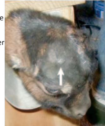
FiasCoFarm Photo No. 1

Once you have two dark copper rings, the job is done. No need for medications. The cauterized areas will scab in the next few days and the scabs will fall away within 3 to 5 weeks. The scabs will not necessarily fall off on the same day. Often times one will fall off several days earlier than the other. This is normal.