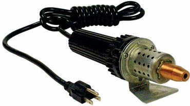
Rhinehart Model X-30 SPL (Shown with pygmy tip)

Customers who purchased this product were also interested in the products below